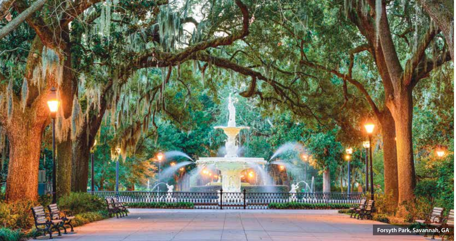
Forsyth Park, Savannah, GA