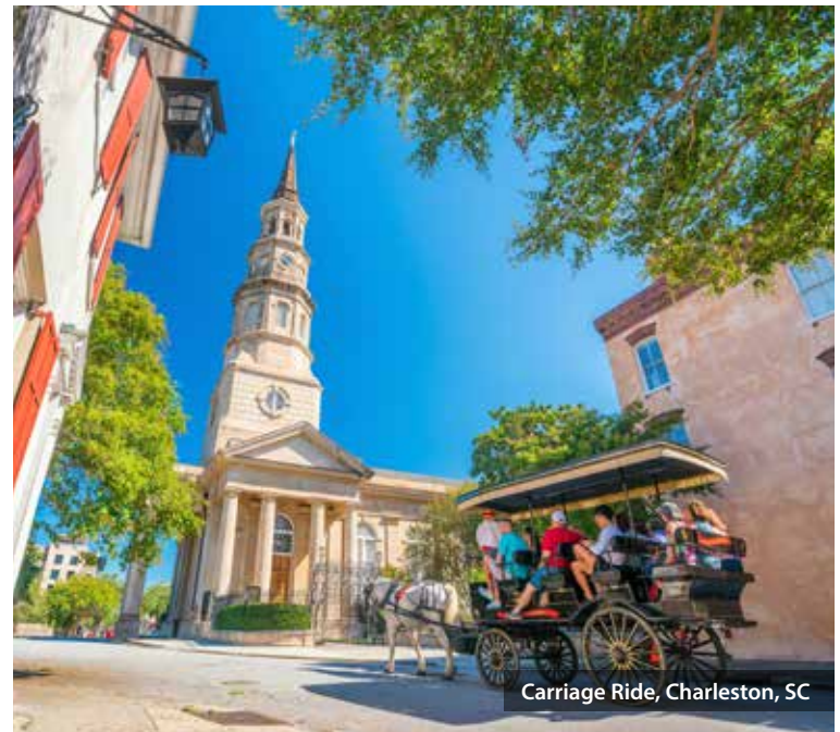
Carriage Ride, Charleston, SC

Fly south to Atlanta where the colors of spring await our arrival. We will continue on to the historic city of Savannah for a two-night stay in the heart of the historic district. Join your fellow travelers for a get-acquainted dinner at the River House Seafood Restaurant where we'll enjoy riverside views of merchant ships and local vessels on the Savannah River. Meals: D