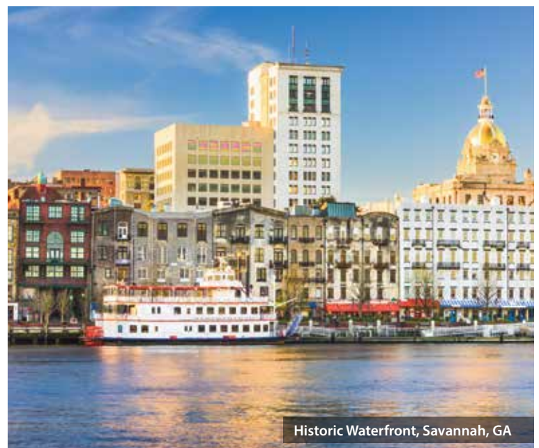
Historic Waterfront, Savannah, GA

The time has come to journey back home and this morning we depart for Atlanta where our return flight awaits us. We head home with the satisfaction of a memorable vacation to the Southeast. Meals: B