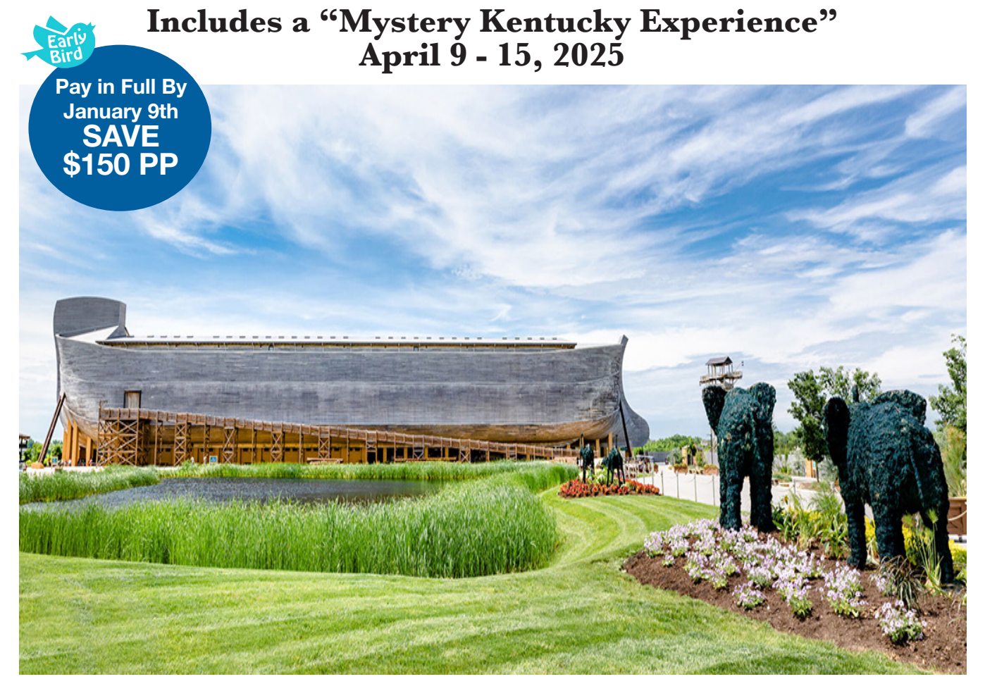
Day 1: Journey Begins to Beloit, WI

Your journey begins today to the beautiful countryside of Kentucky, home to the Creation Museum and Ark Encounter.